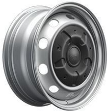
16" Silver Steel Wheel with Black Hubcap

(Standard on Standard Front Axle configurations)