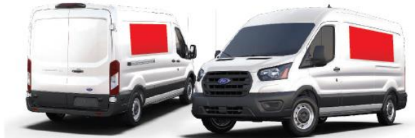
Decal #2 (51F): – Up to 25 sq-ft 1