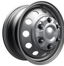
16" Silver Steel Wheel with Silver Hubcaps and Exposed Lug Nuts (641)

(Standard on Standard Front Axle configurations)