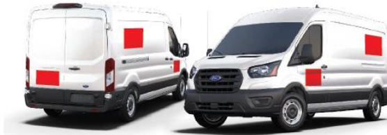
Decal #1 (51E): – Up to 15 sq-ft 1