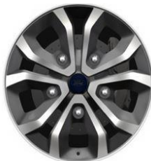
16" Black Aluminum Alloy Wheel (644)