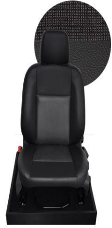
Dark Palazzo Grey Vinyl