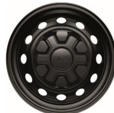
16" Black Steel Wheel with Gloss Black Center Caps (642)