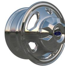
16" Forged Aluminum Wheel (64G)