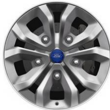
16" Silver Aluminum Alloy Wheel (647)