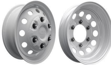
16" Heavy-Duty White Steel Wheel with Exposed Lug Nuts (76D – Fleet Only)

(76E – Standard Front Axle configurations) & (76G – Heavy-Duty Front Axle configurations)