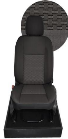
Dark Palazzo Grey Cloth