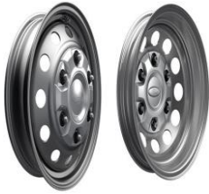
16" Heavy-Duty Silver Steel Wheel with Silver Hubcaps and Exposed Lug Nuts

(Standard on Standard Front Axle configurations) & (Standard on Heavy-Duty Front Axle configurations)