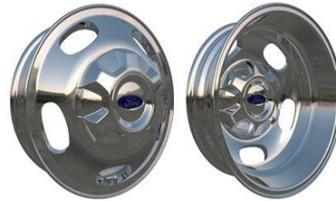
16" Heavy-Duty Forged Aluminum Wheel

(Standard on Standard Front Axle configurations) & (Standard on Heavy-Duty Front Axle configurations)