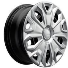
16" Steel Wheel with Full Silver Wheel Cover (64H)

(Standard on Heavy-Duty Front Axle configurations)