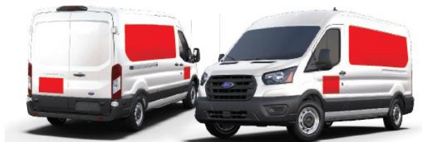
Decal #3 (51G): – Up to 45 sq-ft 1