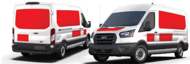
Decal #4 (51H): – Up to 70 sq-ft 1