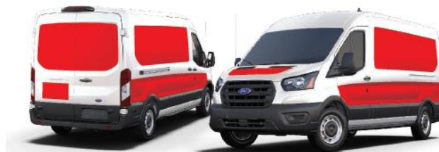
Decal #5 (51J): – Up to 95 sq-ft 1